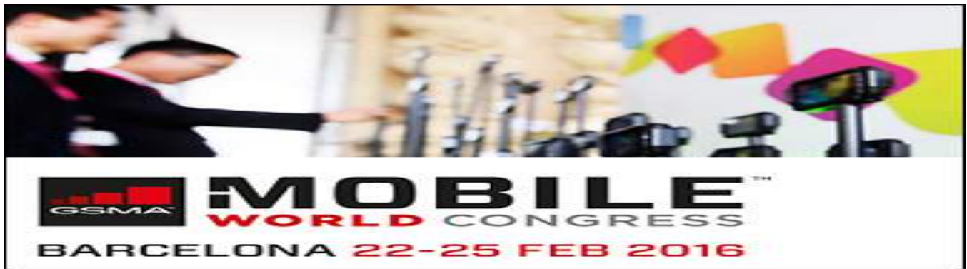
( http://www.mobileworldcongress.com )