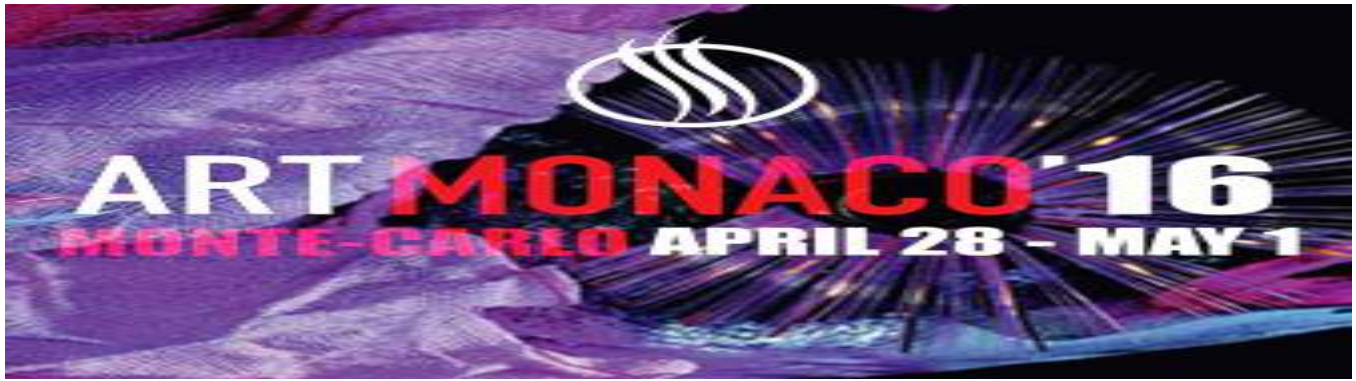
( http://www.artemonaco.com )