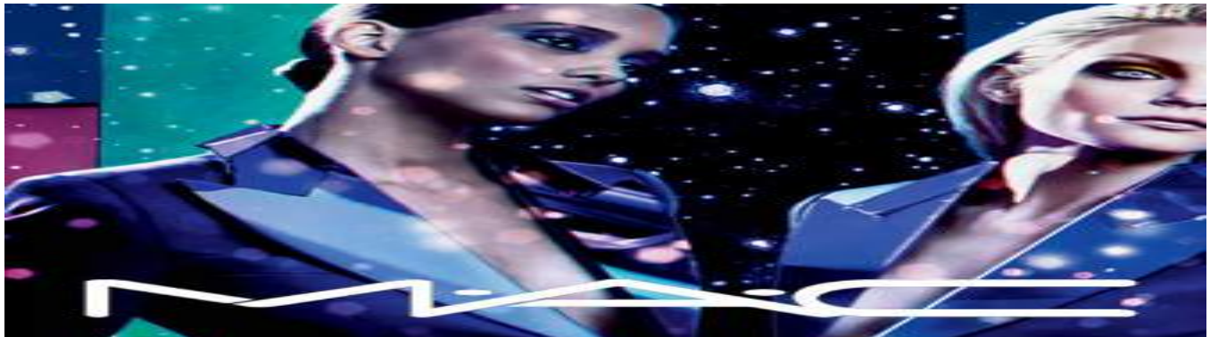
( http://www.maccosmetics.com )