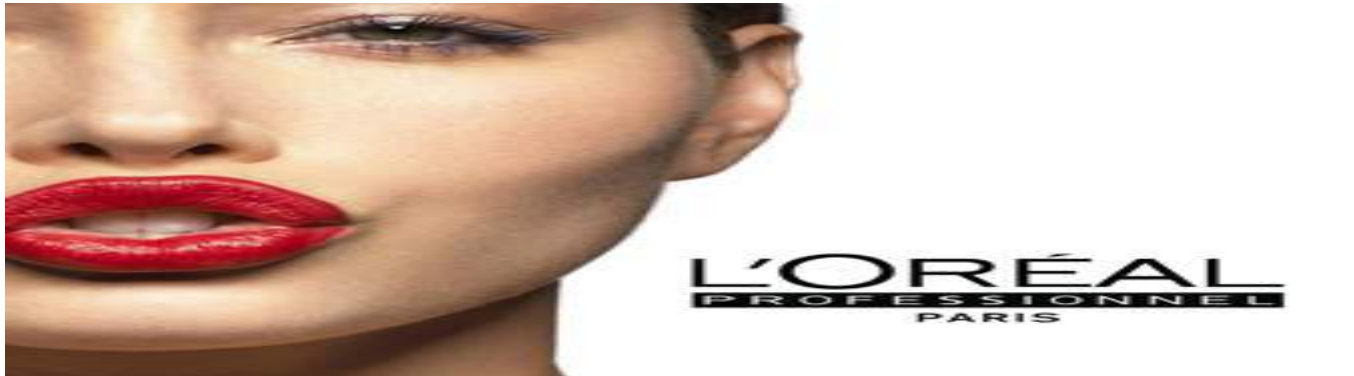
( http://www.lorealprofessionnel.com/int )