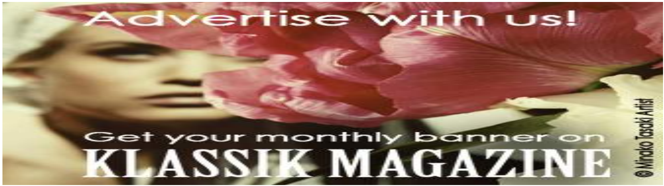
( http://klassikmagazine.com/advertising )