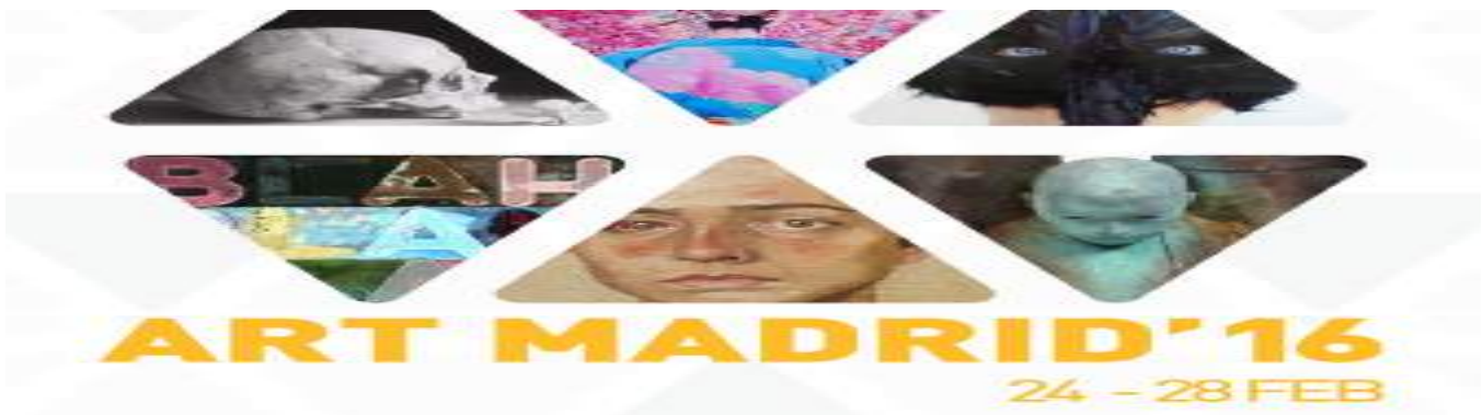
( http://www.art-madrid.com/en )