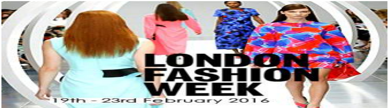
( http://www.londonfashionweek.co.uk )