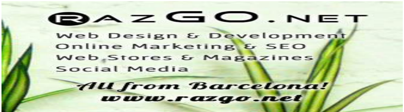
( http://www.razgo.net/eng )