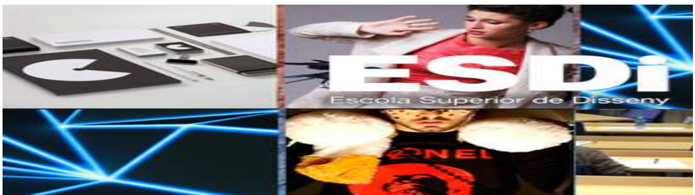
( http://www.esdi.url.edu/en )