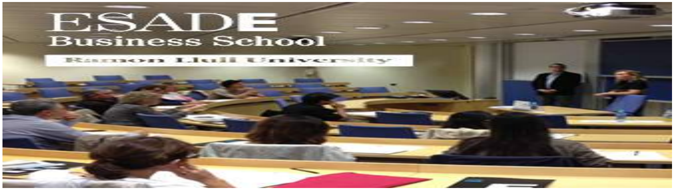
( http://www.esade.edu/web/eng )