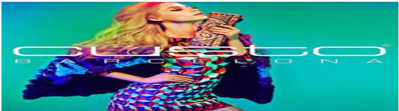
( https://custo.com/es/en/ )