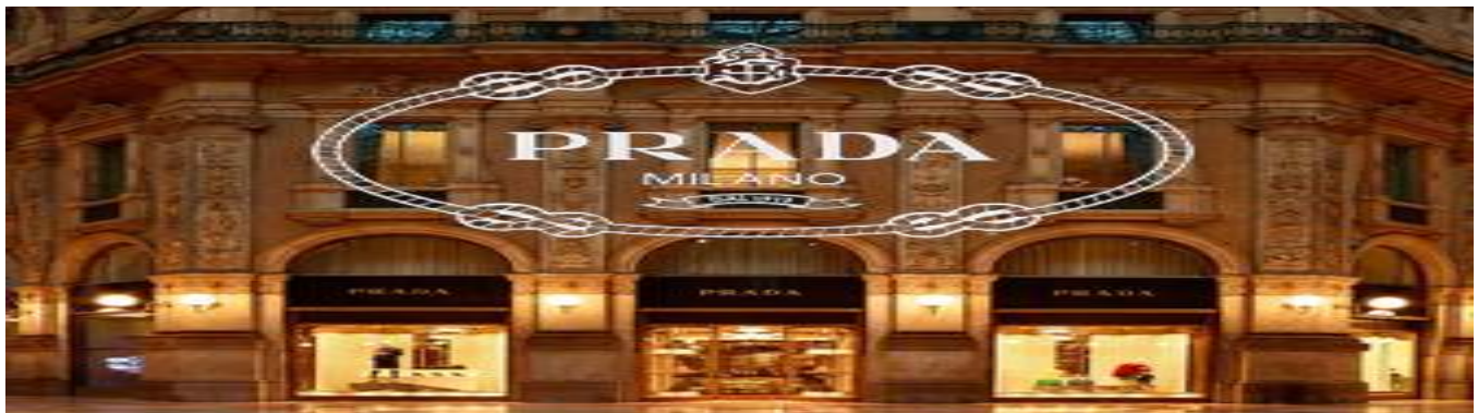
( http://www.prada.com )