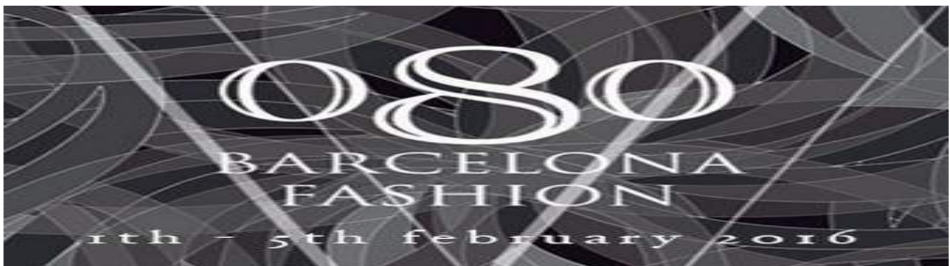
( http://www.080barcelonafashion.cat/en )