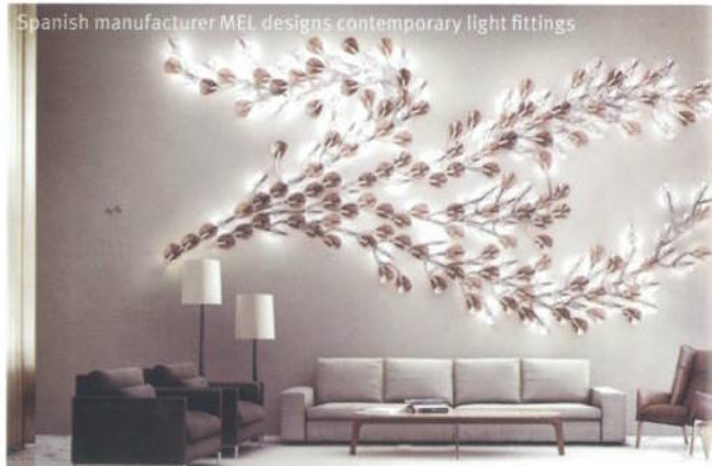
Spanish manufacturer MEL designs contemporary light fittings