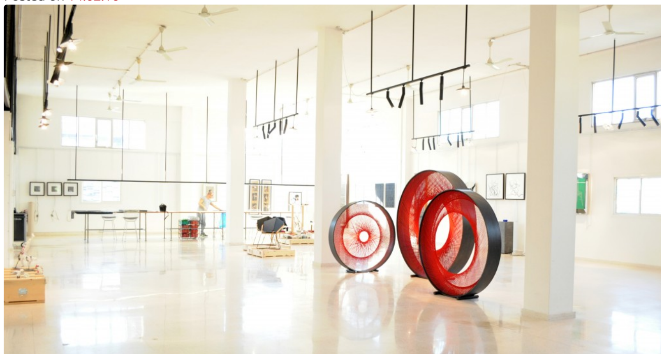
Cities Design Art and Lifestyle Store