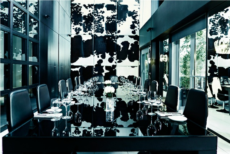
Friday brunch at Gaucho

Gaicho's Friday brunch runs throughout March from 12pm-4pm and the packages start from Dhs320 per person. Gaucho is located at DIFC.