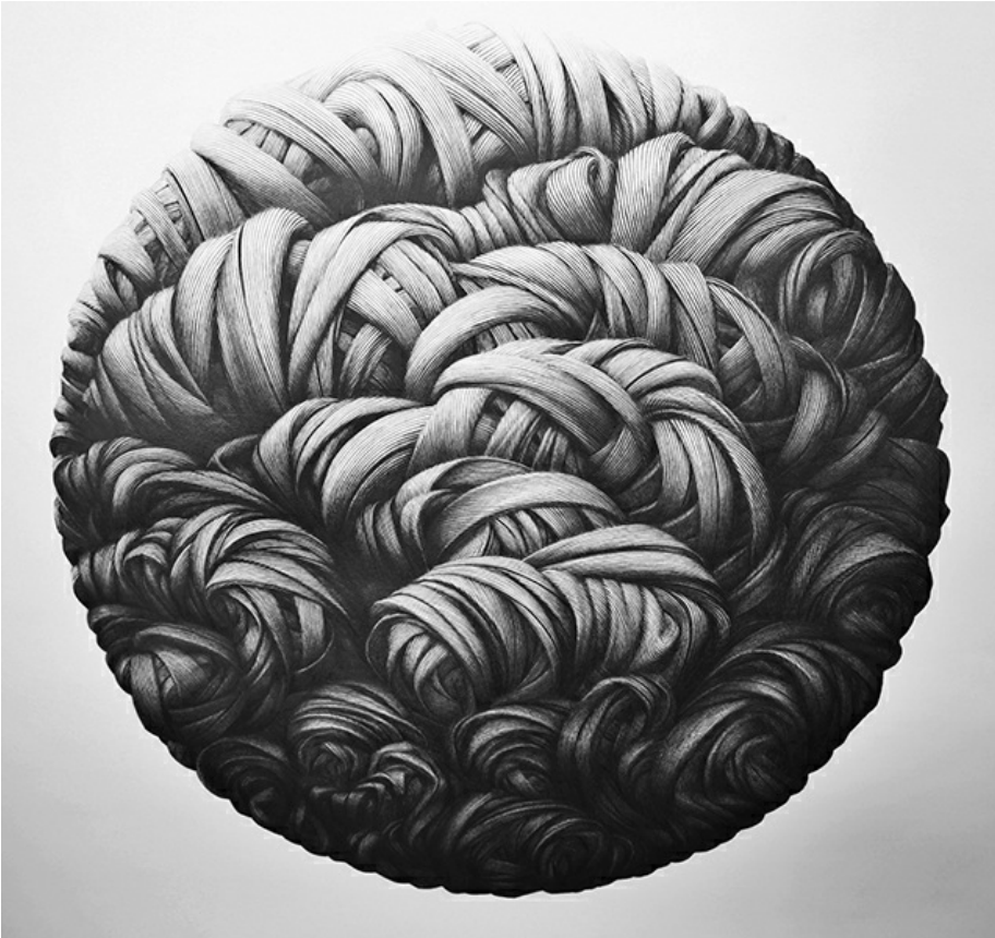
Second Harvest VII by Ahmet Dogu Ipek

Art Dubai runs from March 16-19. For more information, visit artdubai.ae .