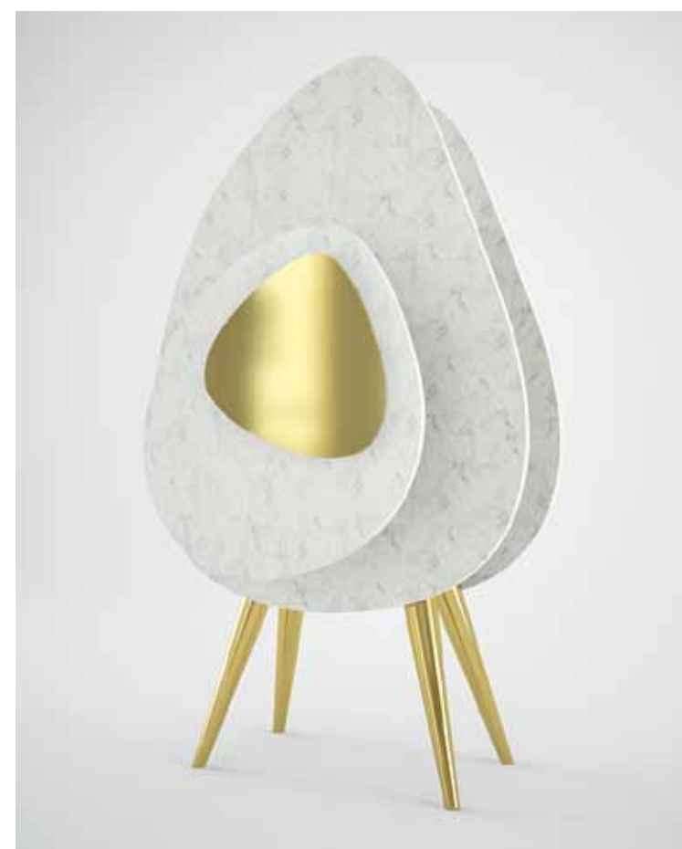
The Hidden bookshelves, Carrara marble and brass, by Loulwa Al-Radwan