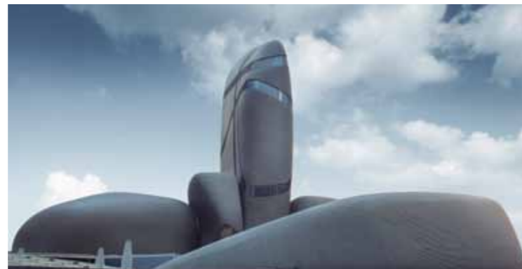
King Abdulaziz Center for World Culture