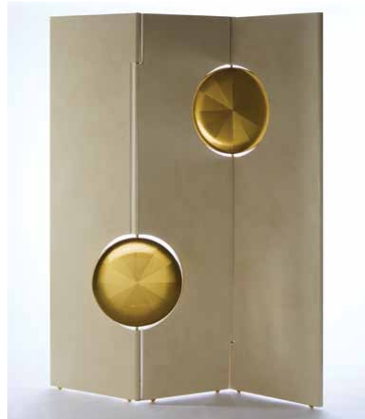
Cosmos decorative screen by Aurelia, JCT Gallery