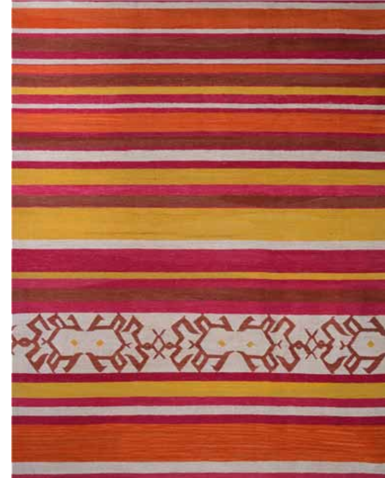
Carpets of Love collection, Samovar (Kuwait), Abdulla Al Awadi