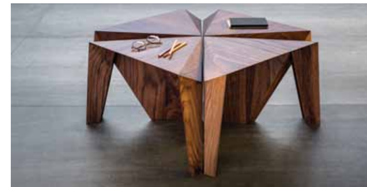
Square One, Tarek EL Kassouf, Squad Design