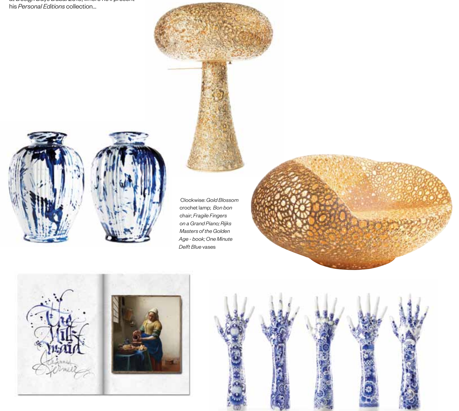
Clockwise: Gold Blossom crochet lamp; Bon bon chair; Fragile Fingers on a Grand Piano; Rijks Masters of the Golden Age - book; One Minute Delft Blue vases