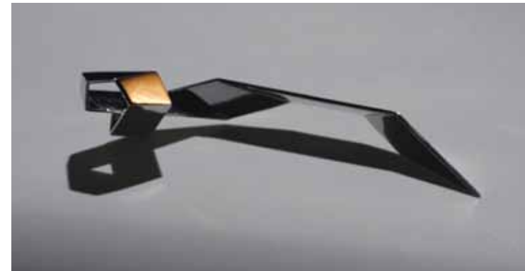
Monogram, Sculptural Collection, 'Waw' Escaping Flatland