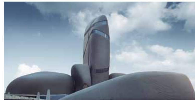
King Abdulaziz Center for World Culture