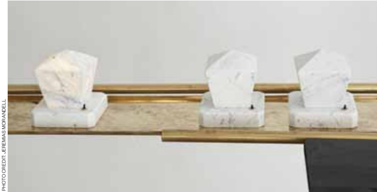
Marble lamp by Veronica Todisco, Camp Design Gallery Adaptations