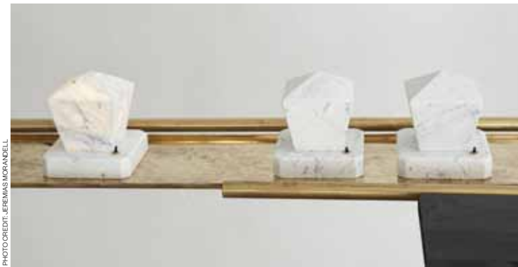
Marble lamp by Veronica Todisco, Camp Design Gallery Adaptations