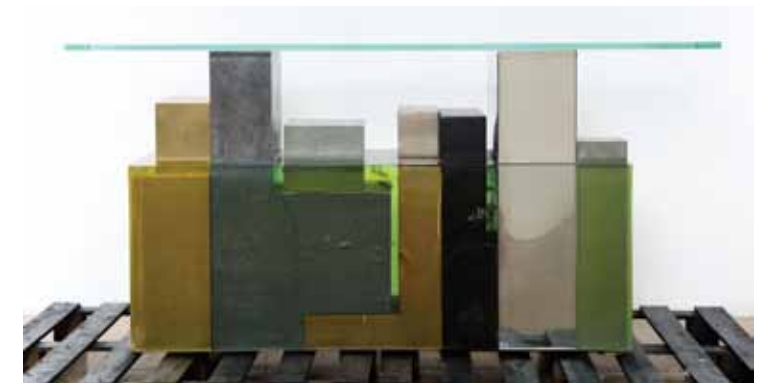
Green Pompeii console, or Nature's Revenge on Urban Sprawl, Georges Amatoury Studio