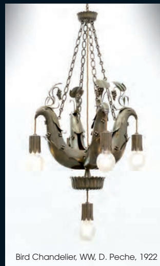
Bird Chandelier, WW, D. Peche, 1922

You will find us in Vienna and, from 15 to 24 March 2013, at the TEFAF European Art Fair in Maastricht, stand no. 606